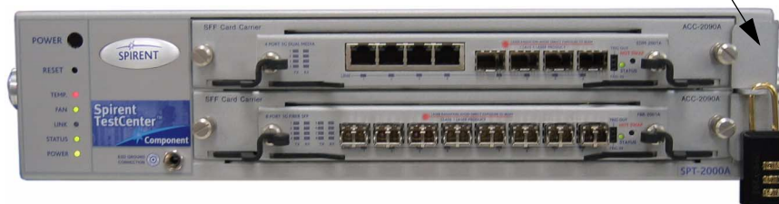
Figure 1. SPT-2000A Chassis with its Built-in LockBar in Use

To use LockBar SPT-2000, pull the built-in LockBar flap toward the front of the chassis so that it overlaps the installed test modules. Then secure the LockBar with the provided combination lock.