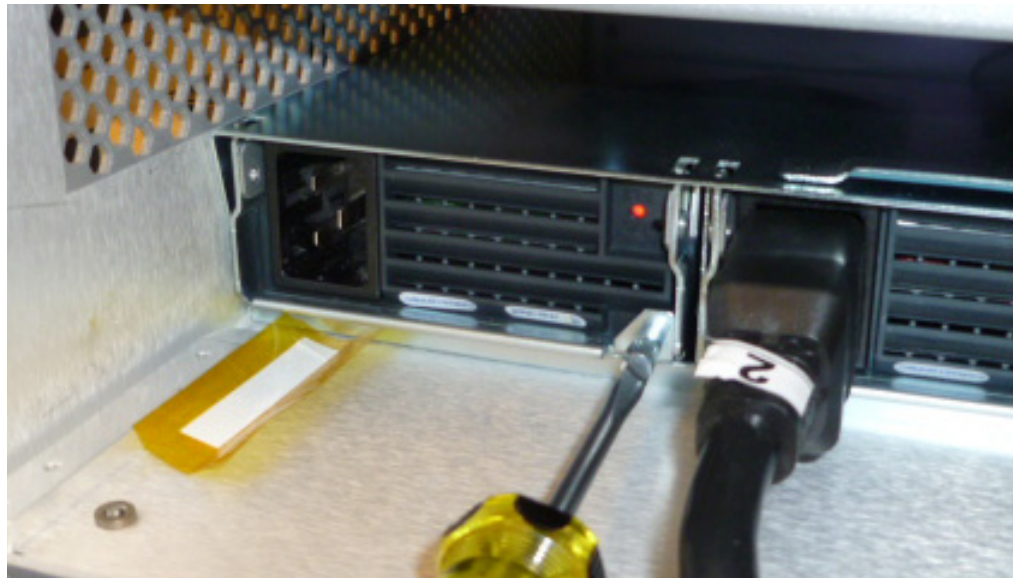
Figure 3. Remove Power Cord and Single Screw