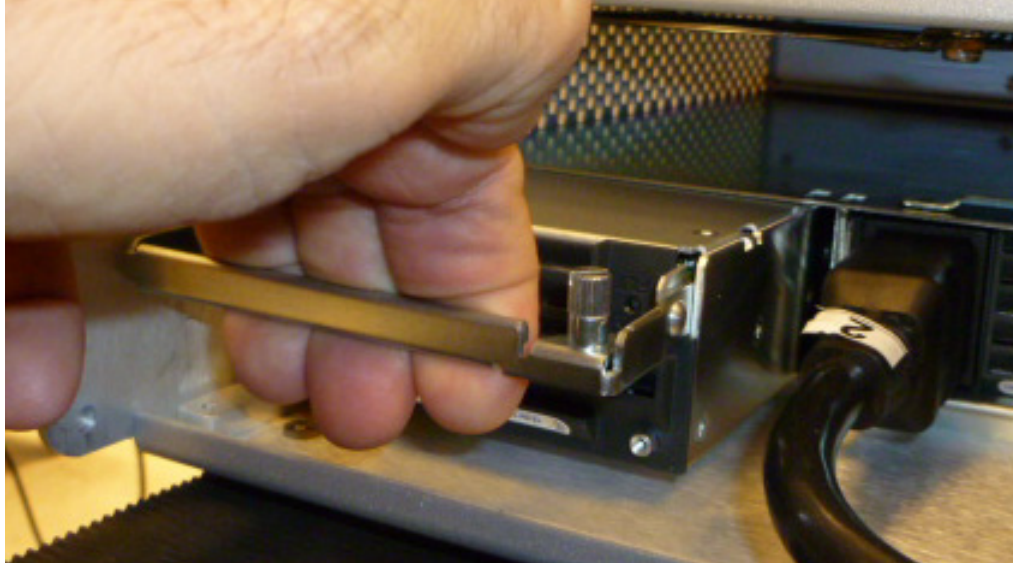
Figure 4. Lift the Handle to Pull Out the Power Supply

Reverse the above procedure to install the new power supply.